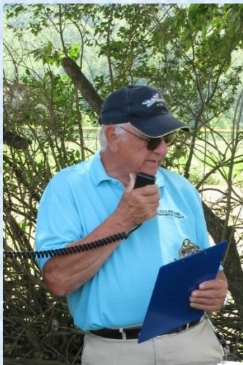
Larry's Heritage Park History Tours