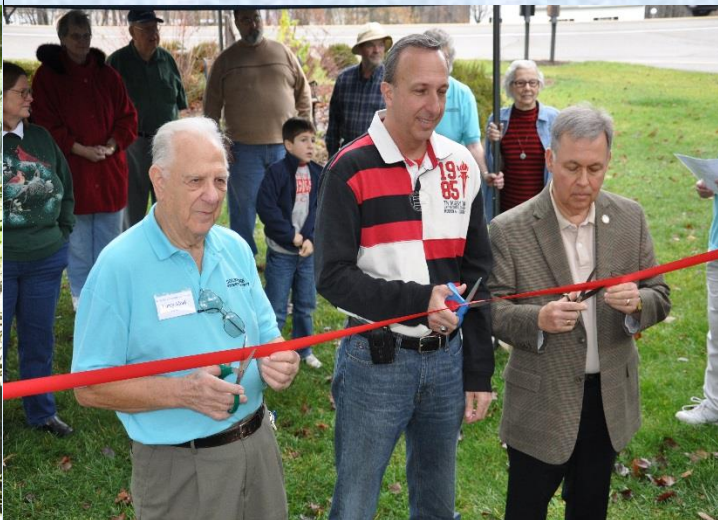
CHS Museum Ribbon Cutting Dec 8, 2012