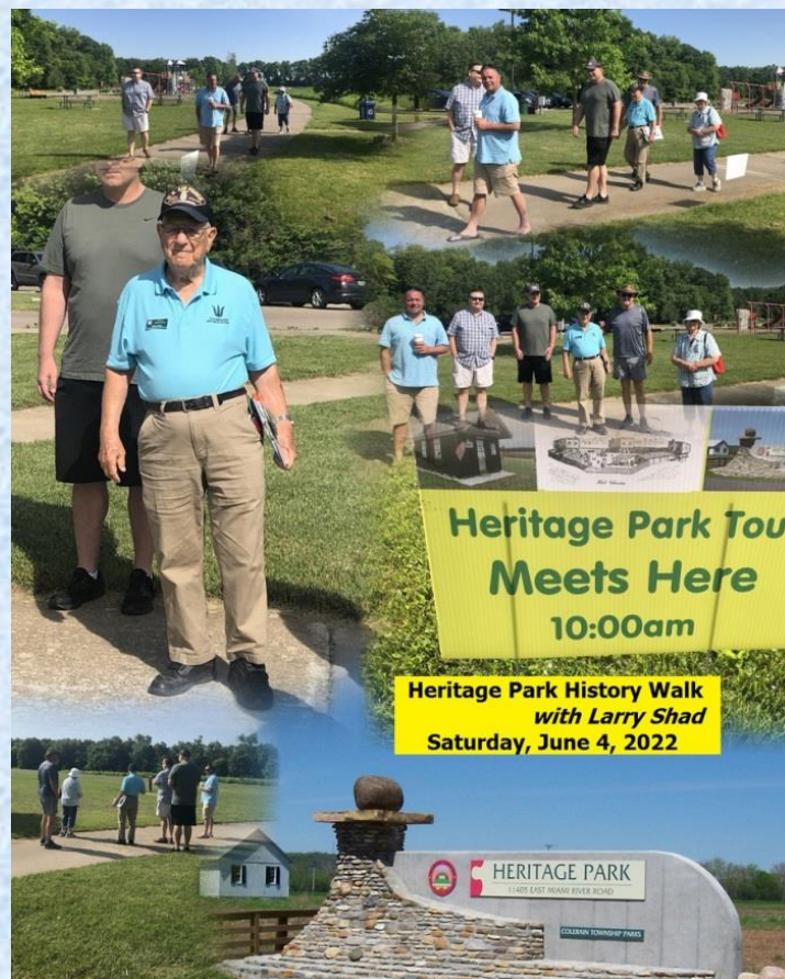
Heritage Park Tour Meets Here 10:00am