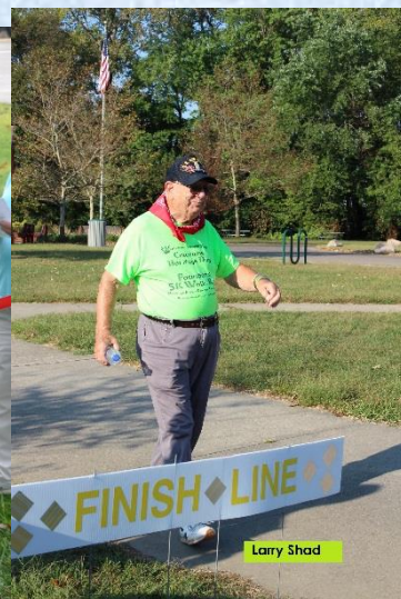
5K Walk/Run Sept. 28, 2019