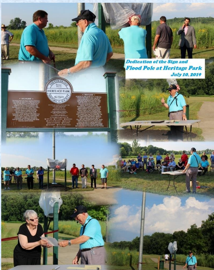
Dedication of the Sign and Flood Pole at Heritage Park July 10, 2019